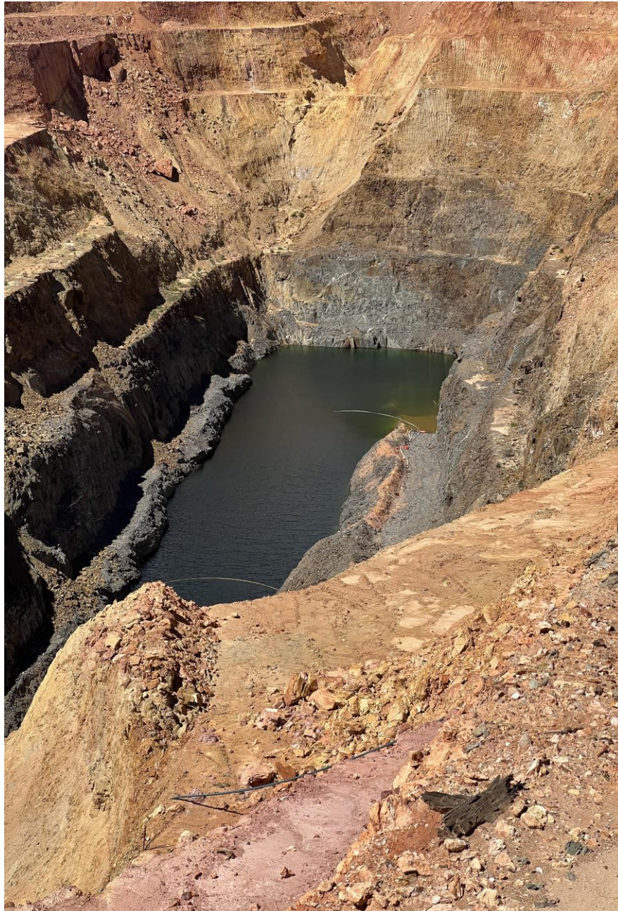
Anglo Saxon open pit April 2024 looking south